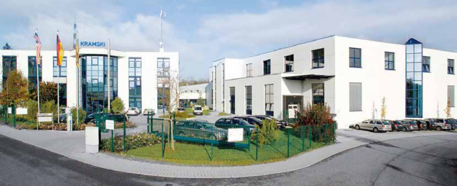
KRAMSKI in Pforzheim - Global solution provider for sophisticated stamping and injection moulding technology.

When designing high precision stamping and forming tools, the challenge is to push the limits of what is possible while increasing production efficiency. Forming metallic materials into the desired shape by drawing, bending or stamping - these processes are complex and subject to many influencing factors that require precise planning and design of the tools. Simulation software plays an important role here, reducing the need for costly preliminary testing to confirm feasibility at an early stage. Alternative test runs are not only time consuming and costly, but can also significantly delay the product development process. In particular, complex processes can be simulated and analysed virtually in advance. This allows adjustments to be made before physical moulded parts have to be produced.