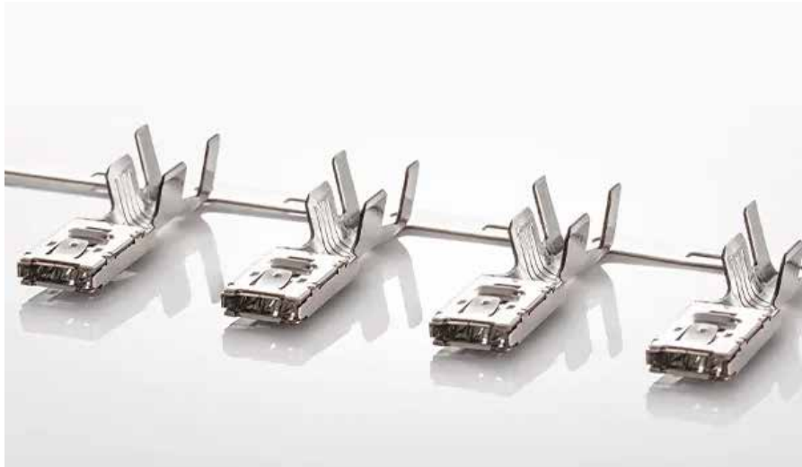
A multi-part connector manufactured in a single stage process. Selectively galvanised stamped strips with standard sheet thicknesses of 0.2mm-0.4mm are used.

ever-increasing time-to-market demands and international cost pressures, simulation software has become an indispensable part of our everyday lives. The use of Stampack in our design department has proven to be a complete success - even in an international environment'.