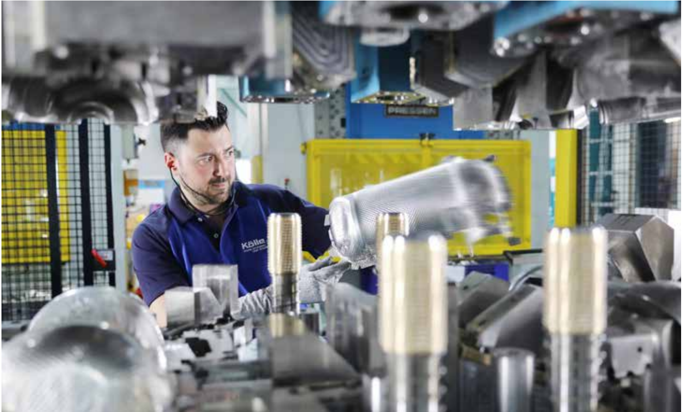
Kölle develops and builds tools for a wide variety of demanding stamped, drawn and bent parts made from the common materials aluminum, steel and stainless steel.

Stampack Xpress shows its strengths not least in heat shields. The reason for this are very thin calotte-coated sheets (with dimples) and severe wrinkling. Wrinklings are allowed at some places in the sheet metal and forbidden in many others.