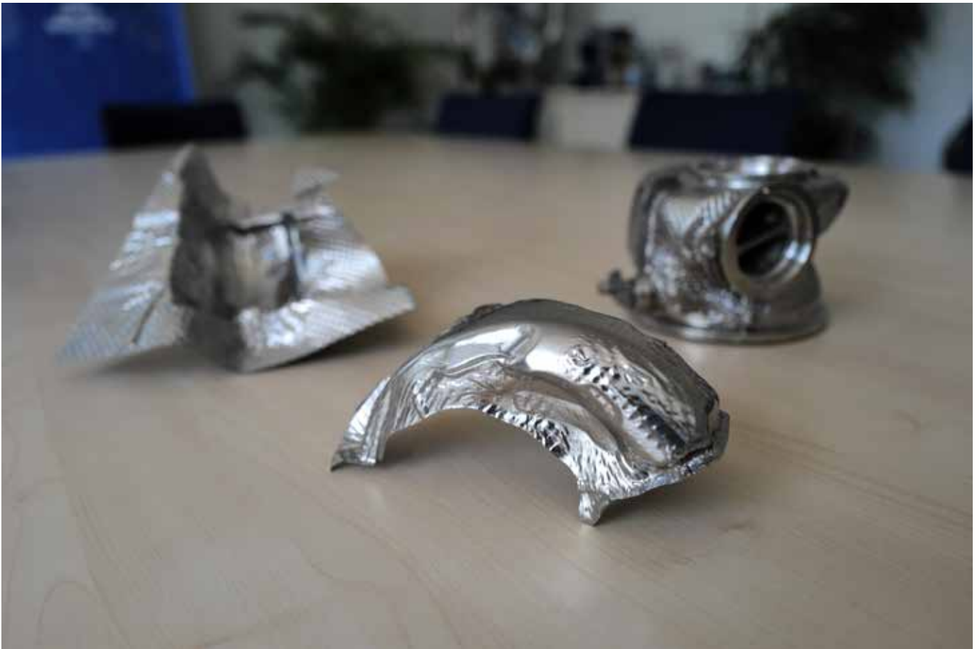
Half-shell for thermal insulation of turbochargers.