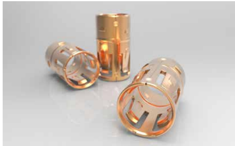
Rosenberger Stanztechnik focuses on the production of sophisticated, high-precision contact parts for the automotive, telecommunications and electronics industries.

production tolerances and display deviations graphically. The fast solid solver accurately simulates the processes in forming thick sheets and coining and is therefore also ideal for simulating progressive die processes. Stampack has fully met the expectations of the specialists at Rosenberger Stanztechnik. In the past, the coordination work for very complex products with multiple steps was very time-consuming and cost-intensive for some projects. After all, the geometry of the blank sometimes had to be determined in several tests, and support had to be provided during product development and feasibility analyses. „Thanks to Stampack, we have been able to achieve the goals we set ourselves, such as shortening tool coordination times and thus reducing throughput times. In addition, we can now save resources and production capacity by reducing recursions and detecting blank cracks at an early stage during heavy forming,“ concludes Stefan Maier. „In addition to the short calculation times of the solid solver, we particularly like the user-friendliness of the software, which enables our designers to visualise even complex forming processes on the computer in a very short time. Due to these consistently positive experiences with Stampack, the software is now also being used at the headquarters of Rosenberger Hochfrequenztechnik GmbH in Fridolfing“.