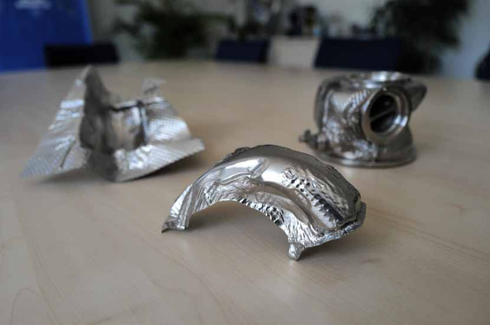
Half-shell for thermal insulation of turbochargers.