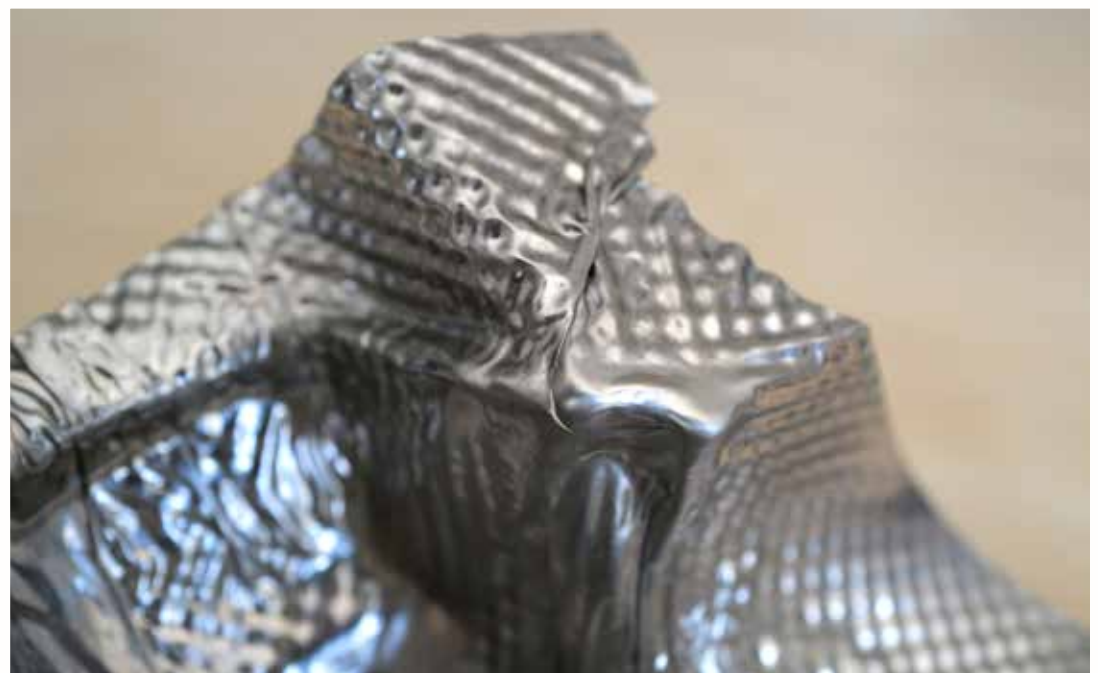
Cracked shell due to unfavorable folds.